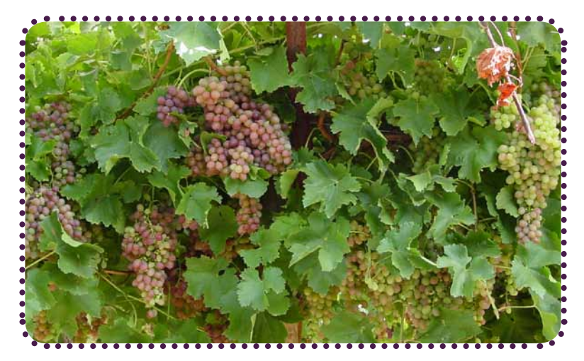
Poor coloured grapes