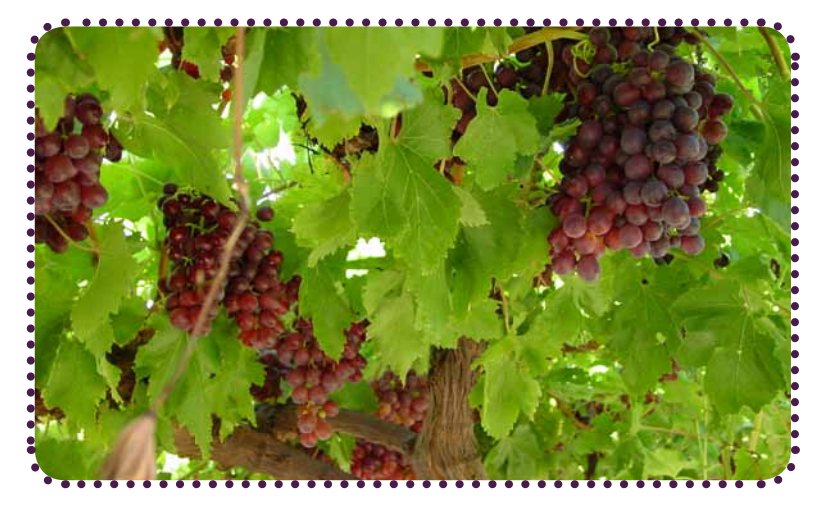
Colour after application