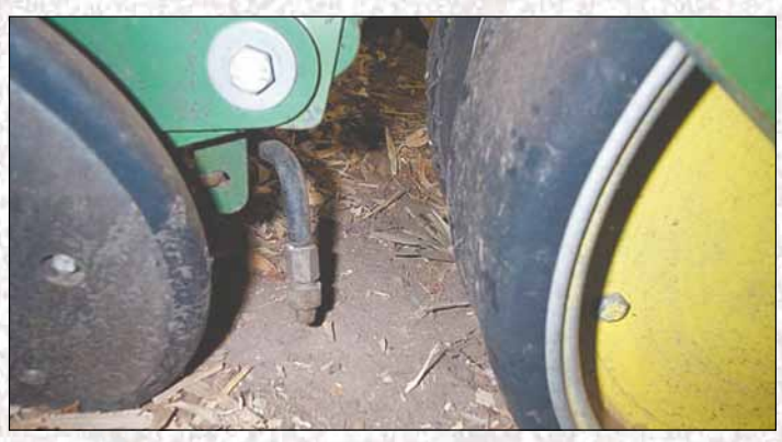
Spray nozzle set up to apply Rizolex InFurrow in the furrow after seed and fertiliser placement.

Rizolex InFurrow should be sprayed at a minimum of 100 L/ha in furrow, with adequate separation from seed and granular insecticide tubes. Planters can easily and economically be set up for the application of Rizolex InFurrow (see below).