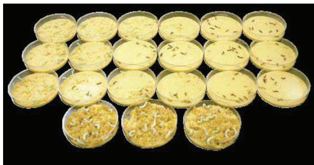
Each batch of DiPel is tested on over 2000 lepidopteran larvae at various stages in manufacturing.

Tests on Bt products have shown that some contain low levels of toxin proteins and low potency resulting in reduced efficacy. Both DiPel and XenTari are manufactured to the highest standards by Valent BioSciences (VBC) in the USA. VBC see fermentation of the insecticidal proteins produced from Bt strains as a mixture of science and art. Every batch of DiPel and XenTari must meet a number of sampling and potency checks throughout production to ensure the quality and efficacy of the toxin proteins in every batch.