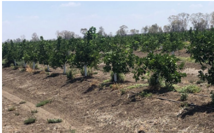
EndoPrime inoculated orange trees showed superior establishment and growth