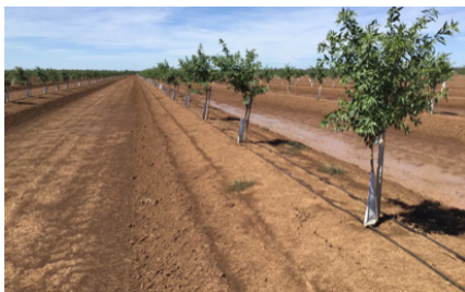
EndoPrime treated almond trees at Carrathool, NSW, showed 100% transplant survival and excellent growth

EndoPrime treated trees showed 100% transplant survival vs 4% loss in the untreated trees (6 months post-planting). The value of EndoPrime in this trial is demonstrated through removing the labour requirement for replanting and through negating any lost productivity in replaced trees.