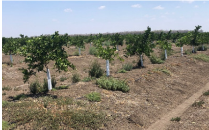
Untreated orange trees with uneven establishment

Treated trees analysed via NDVI drone imagery showed 18% increased tree volume and superior evenness at 2 years post treatment and planting.