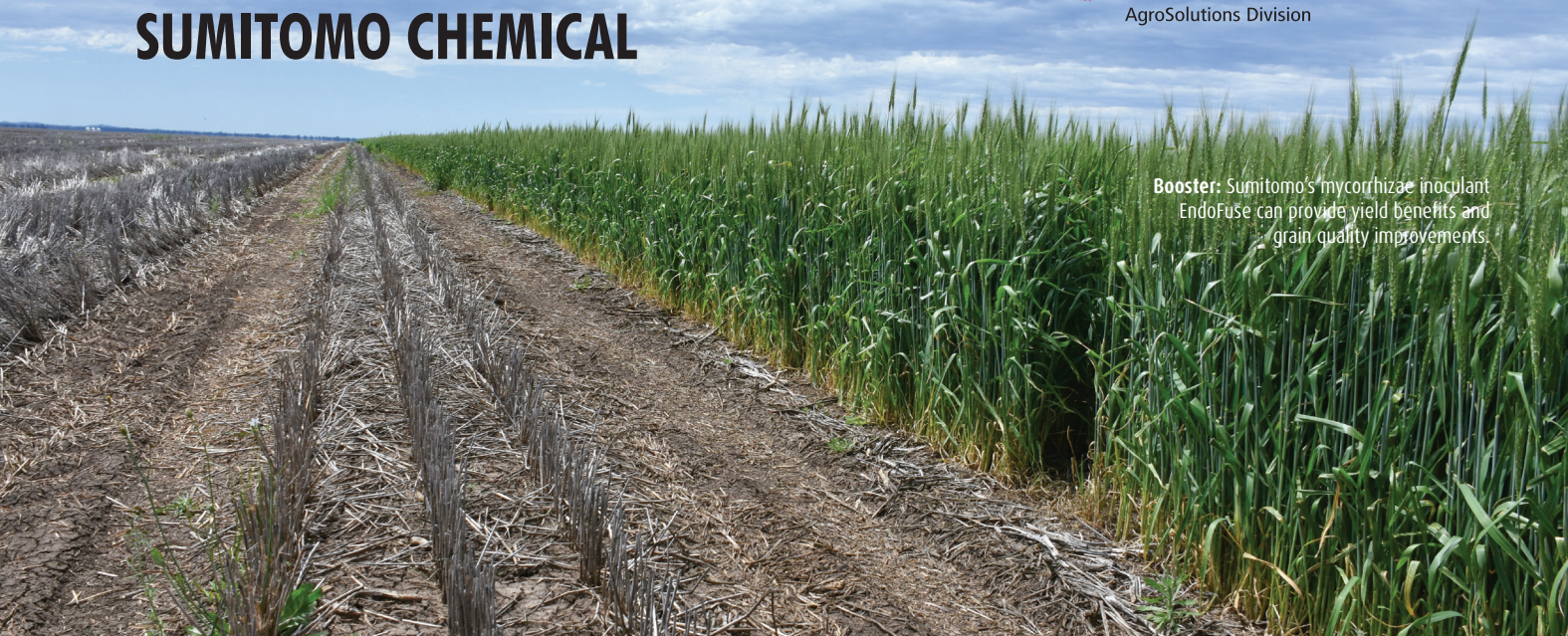
Booster: Sumitomo's mycorrhizae inoculant EndoFuse can provide yield benefits and grain quality improvements.