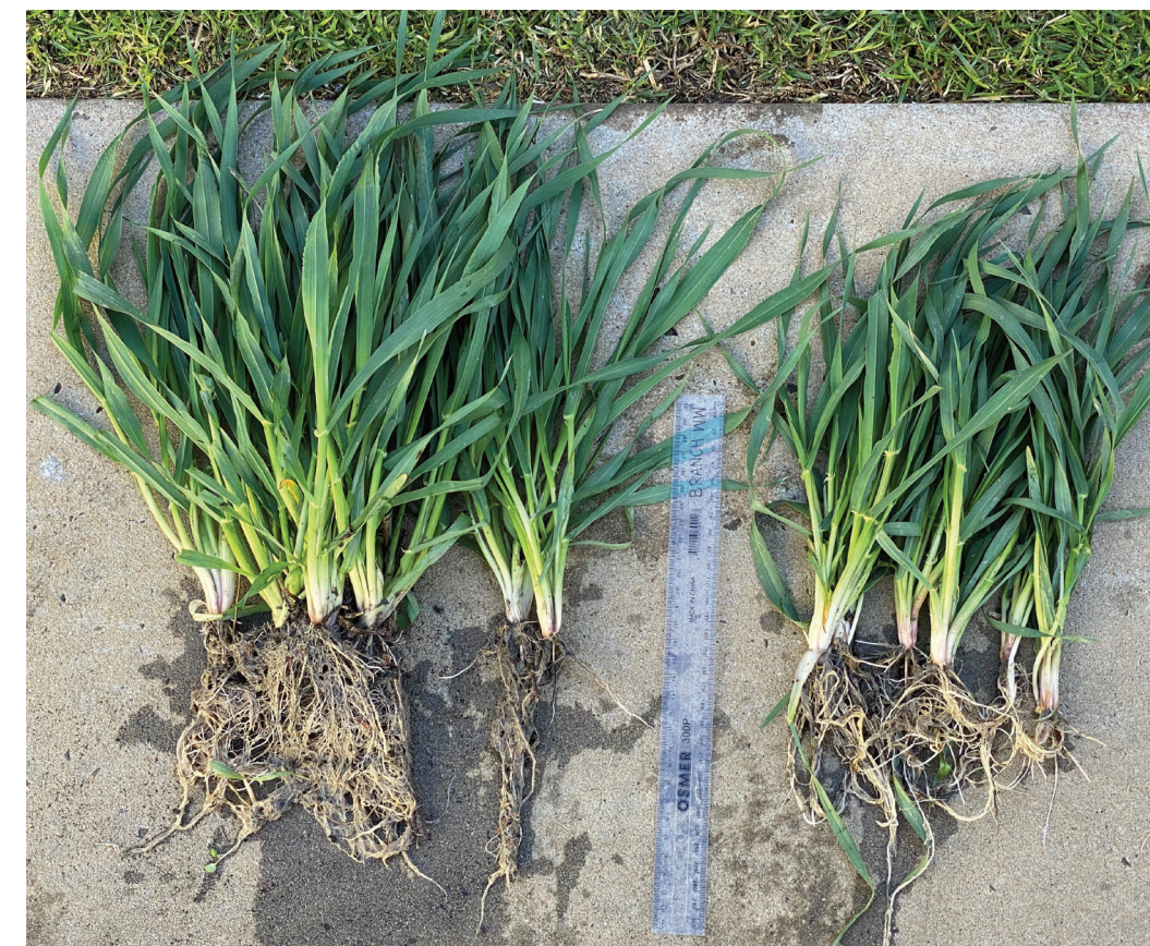
An EndoFuse mycorrhizae inoculated barley crop at Wee Waa, NSW in July this year. EndoFuse treated barley on the left with untreated on the right. The photo clearly shows the increased growth achieved compared with the uninoculated crop.

Given the yield and quality improvements that have been seen in recent trials, the relatively low cost per hectare of EndoFuse provides an excellent return of investment, especially when you factor in that you are also building your long-term soil health.