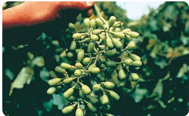
Ready for second size application