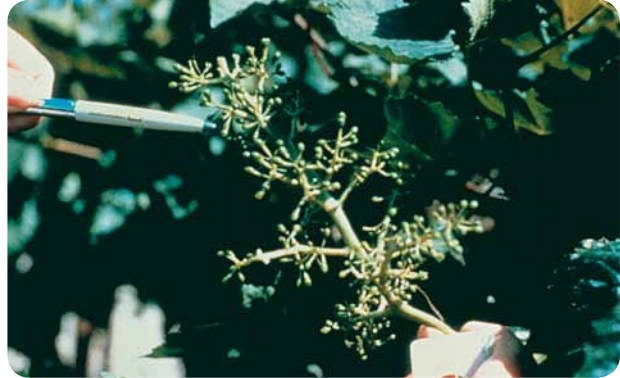
4 mm to 5 mm berry size

Use the same rates as the first spray, applying this spray 5-7 days after the first spray. Timing of the second spray will be dictated by experience and temperatures occurring during the interim between sprays. To gain optimum results it is best to spray early morning or during the evening. The longer ProGibb stays on the berries, the maximum uptake will be achieved to increase berry size.