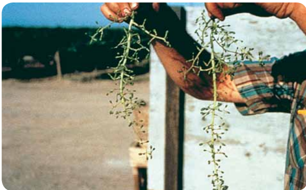
Result of a good thinning job

Other indicators of bloom being in progress are cracked caps, many caps on the ground and the smell of bloom in the air and bunches turning colour. All spray timing should be judged on the top part of the bunch, as the bottom part will be removed at the end of the thinning.