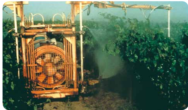
Complete coverage is vital

ProGibb SG is compatible with DiPel® DF Biological Insecticide and Sumisclx® 500 Fungicide.