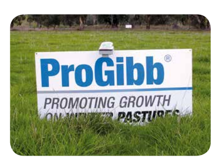
Holbrook NSW - 20 g/ha (18 DAT)

Winter and spring are vital months for balancing pasture growth and providing quality feed for meat and milk production.