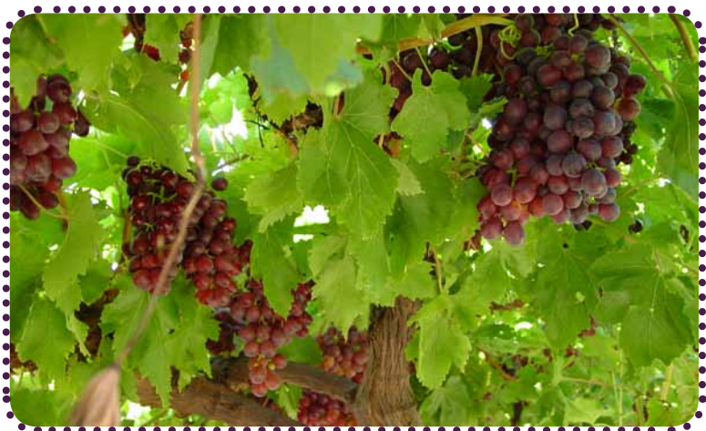
Colour after application