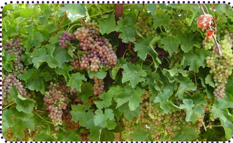
Poor coloured grapes