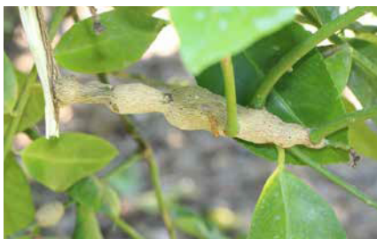
Citrus trees severely infested by citrus gall wasp showing galls from previous season