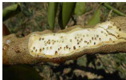
Last season gall