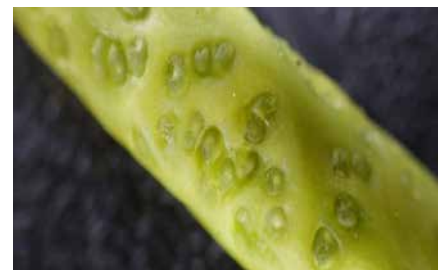
New season eggs / larvae

For further information on Samurai, please contact: