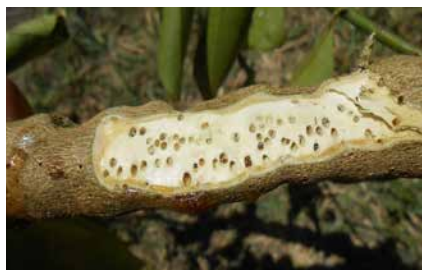
Last season gall