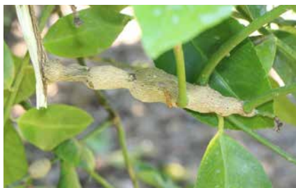
Citrus trees severely infested by citrus gall wasp showing galls from previous season