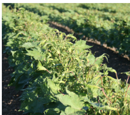
Typical 2,4D drift damage to cotton