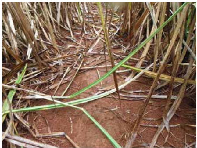
Valor @ 480 g/ha 85 DAT