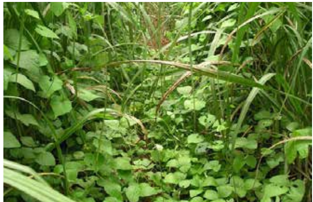
Untreated control 14 DAT

Knockdown control of Calopo, Square weed and Pink convolvulus