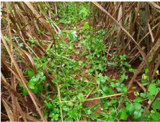
Untreated control 85 DAT