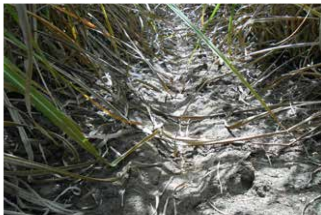
Valor @ 400 g/ha + Paraquat @ 1.5 L/ha + Dual Gold® (s-metolachlor) @ 1.8 L/ha + Hasten @ 0.4 L/100 L of water 54 DAT