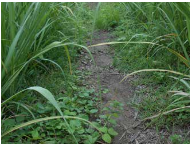
Untreated control 42 DAT