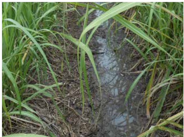
Valor @ 560 g/ha + Gramoxone® @ 1.5 L/ha + Hasten™ @ 0.4 L/100 L of water 42 DAT