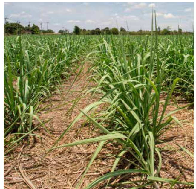
Valor treated row after flooding

Valor providing excellent weed control where a trash blanket is present