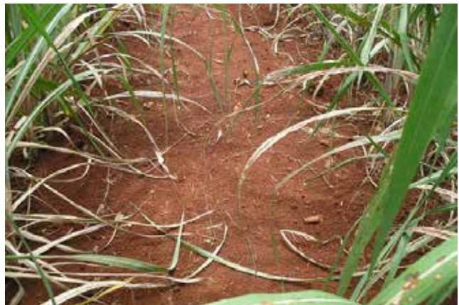
Valor @ 120 g/ha + Atrazine 1350 gai (1.5 kg/ha) + Hasten @ 0.4 L/100 L of water 14 DAT