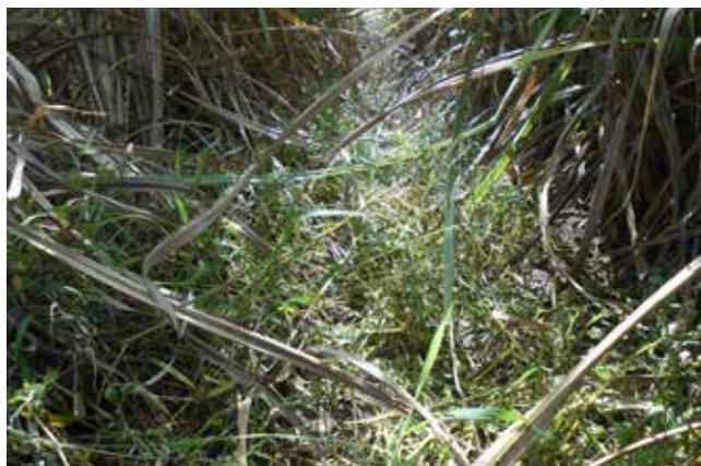
Untreated control 54 DAT